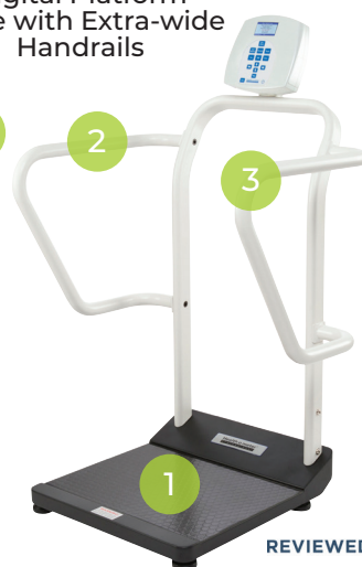
1100KL Digital Platform Scale with Extra-wide Handrails

REVIEWED FOR ADA COMPLIANCE CERTIFICATION N° 5776764