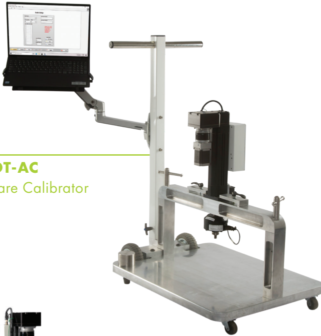
CALIBOT-AC Acute Care Calibrator

The Health o meter® Professional Scales automated calibrator, is a robust innovative calibration system that allows biomedical engineers and other medical technicians to quickly and safely calibrate medical patient scales without having to transport and stack physical calibration weights on the scale. Eliminating the cumbersome physical calibration weights from the calibration process reduces the time needed for routine scale maintenance and eliminates the safety risks associated with handling heavy dead weights. Traceable to the NIST, the automated calibration system records all calibration activity eliminating manual record keeping and simplifying audit activities.