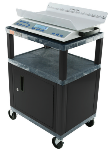
2210CART Optional Rolling Cart

To learn more, call 1-800-815-6615 or visit homscapes.com/2210KL-AM