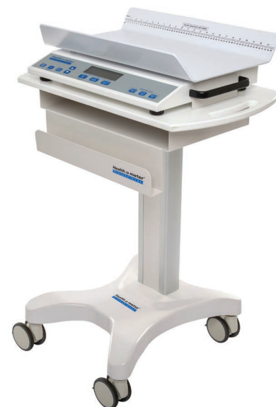
2210CART-AC Multi-Function Acute Care Cart for 2210KL-AM-C Series of Scales

Scale also includes connectivity capabilities. To learn about connectivity options, visit homscases.com/ConnectivitySolutions