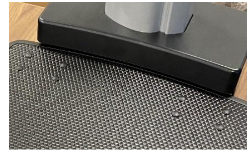
Scales with cover caps, perform step 9.A then proceed to step 17.